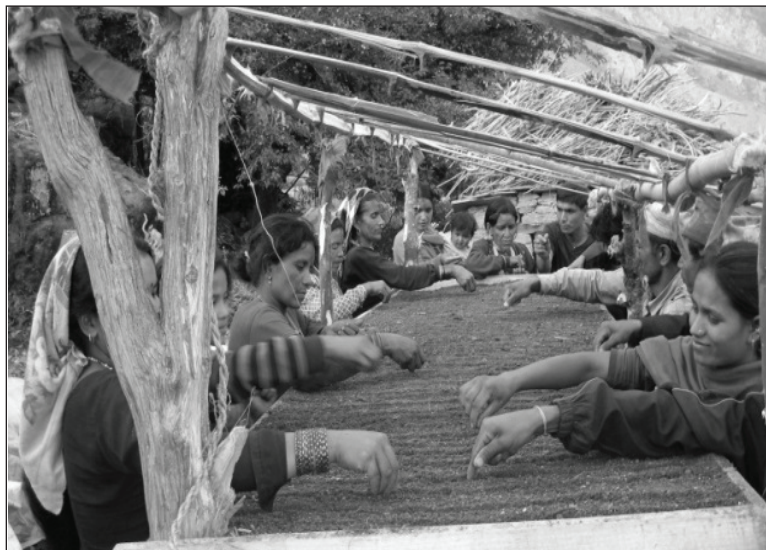
Figure 2. Participants at an ELF training session, practicing the preparation of a table nursery for off-season tomato production in Diyale VDC, Okhaldhunga District in the east of Nepal (June 2012)