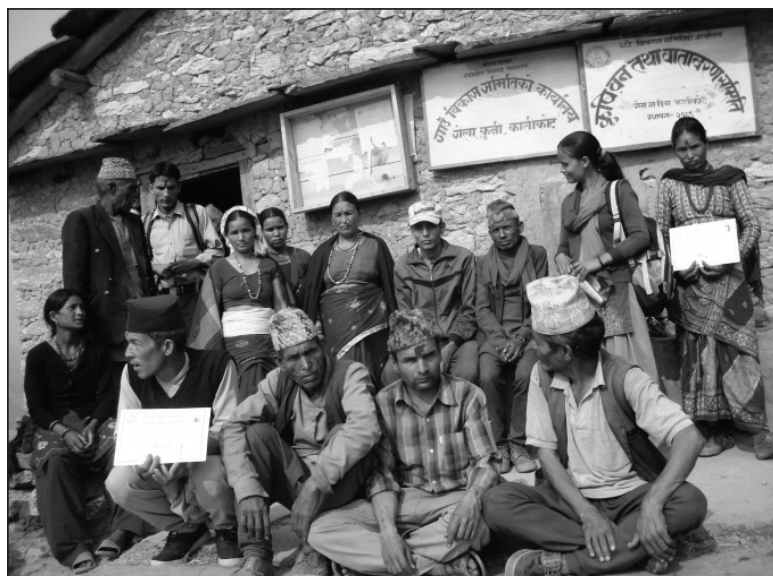
Figure 5. AFEC members after the election process in Gela VDC, of Kalikot District in western Nepal (June 2012)